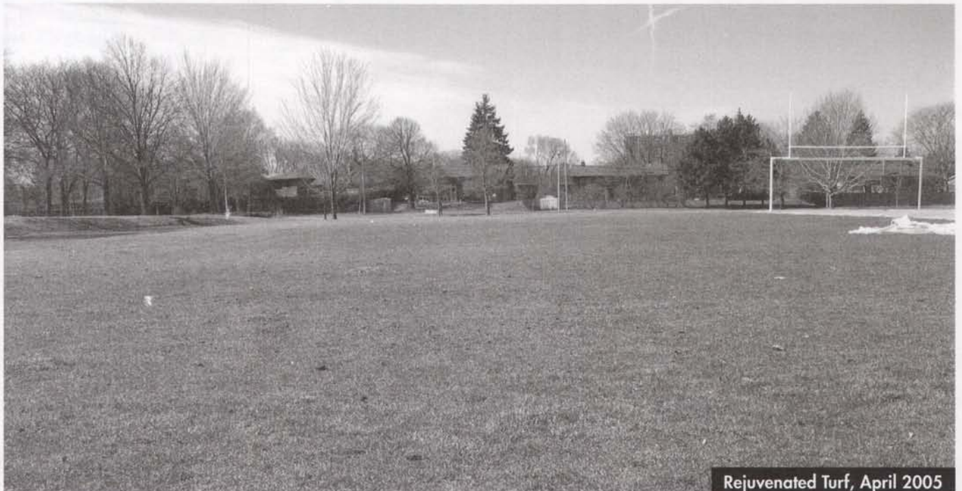
Rejuvenated Turf, April 2005

A sustainable system of PHC recognizes the importance of best practices associated with soil biological health and involving applications of quality organic materials. The organic management component of PHC is designed to work with nature. By consistently employing a particular organic set of turf management practices, healthy growth is encouraged while having the least possible negative environmental impact. The naturally beneficial qualities of plants are maximized with a healthy plant becoming its own best defence against stress. Key organic inputs are utilized as a collective set of tools that