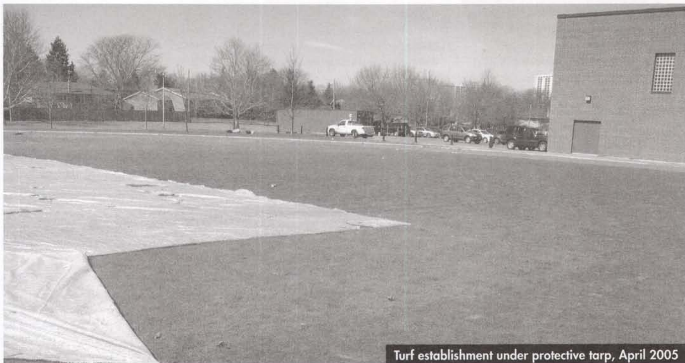
Turf establishment under protective tarp, April 2005

are involved in the consistent delivery of best PHC practices.