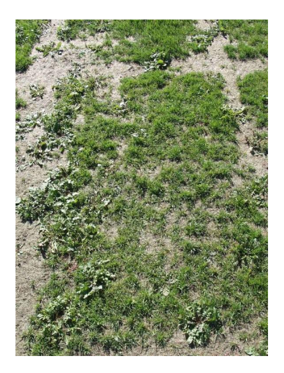
Figure 1. Slow establishment of prairie junegrass can lead to high levels of weed invasion.