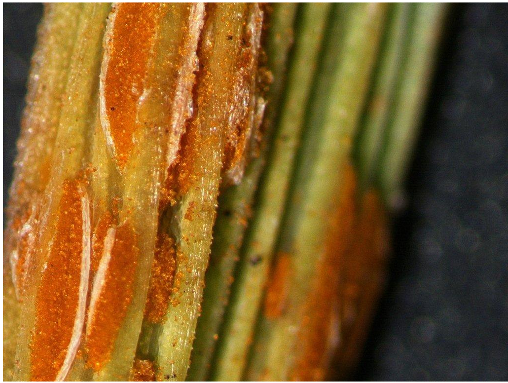
Figure 2. Leaf rust is a common problem on native accessions when grown as turf.