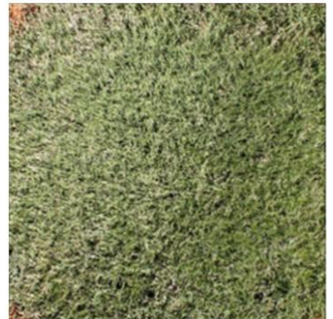
Figure 5. Prestige buffalograss performance following two years of light treatments. Prestige was grown in full sun or under black shade cloths that block 30% or 60% natural light.