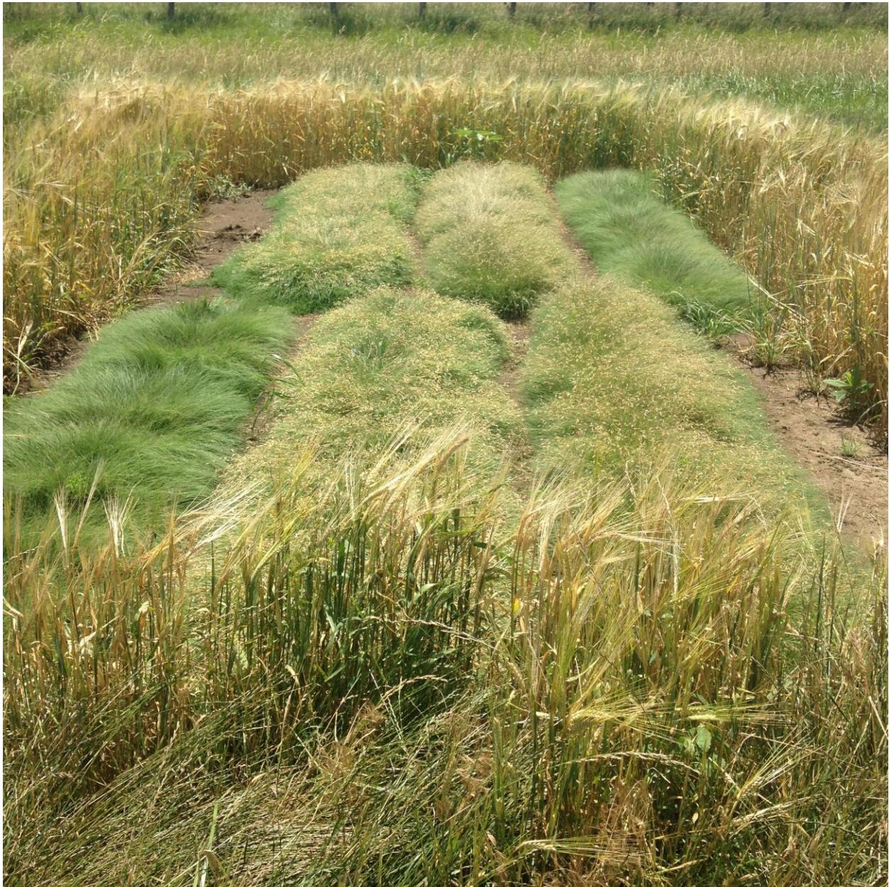
Figure 1. Isolated buffalograss crossing block at the UNL turfgrass research center near Mead, NE.

tests. Turfgrass quality was grouped based on soil types and plotted. No significant differences were observed for buffalograss quality among the different soil textural classes (Figure 3). Multi-year experiments were also completed that were designed to test buffalograss response to traffic (Figure 4) or shade (Figure 5). In each study (soil type, traffic, and shade), variability was found among buffalograss entries for turfgrass quality, suggesting that prior observational-based reports on buffalograss performance should be re-visited.