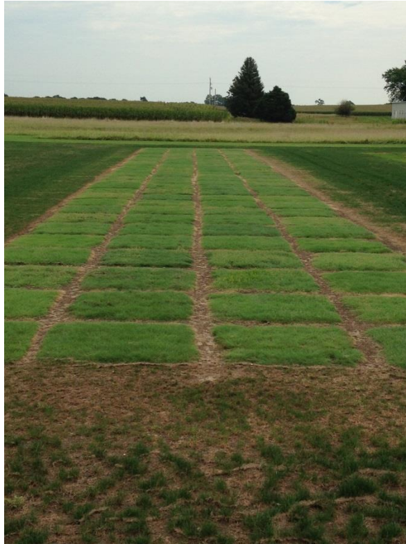
Figure 2. Performance of 40 buffalgrass accessions from an advanced evaluation trial at the UNL turfgrass research center near Mead, NE.