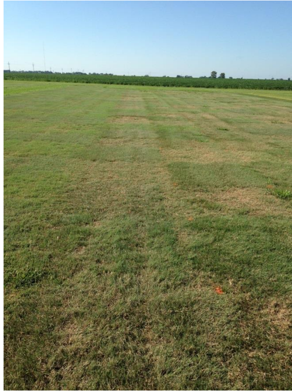
Figure 4. Traffic tolerance variability of 104 buffalograss accessions tested at the UNL turfgrass research center near Mead, NE.