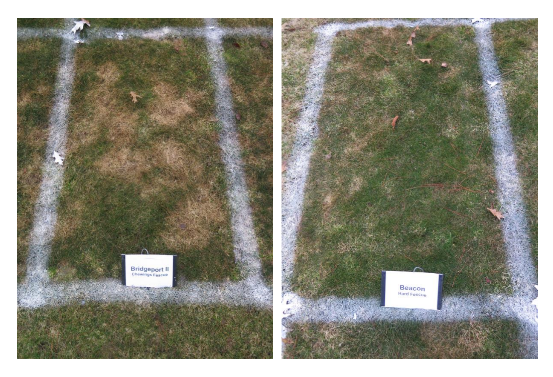
Figure 3. Differences in T. ishikariensis severity on Bridgeport II (Chewings) and Beacon (Hard) fine fescue on March 30th, 2016 at Timber Ridge GC in Minocqua, WI.