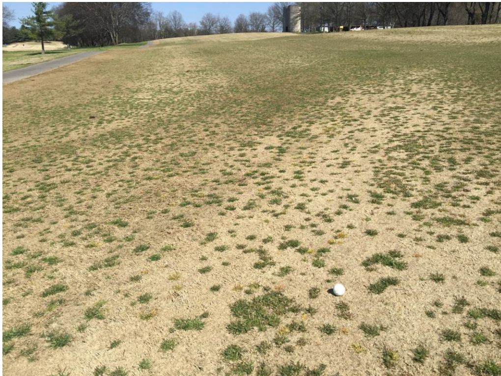
Picture 1- Herbicide-resistant annual bluegrass ( Poa annua ) following two broadcast applications of glyphosate at 1120 \text{ g ha}^{-1} during winter dormancy in Rockford, TN.