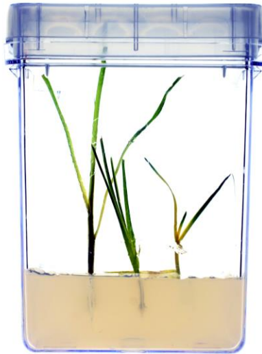
Picture 2- Autoclavable polycarbonate plant culture box used to diagnose annual bluegrass ( Poa annua ) resistance to herbicides in agar culture.