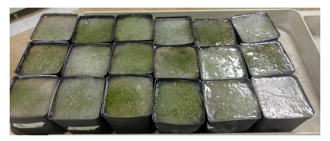
Figure 1 – Annual bluegrass plants treated with Civitas, mefluidide, propiconazole, trinexapacethyl, or untreated under ice (0.5" thick) in a low temperature growth chamber (-4°C)