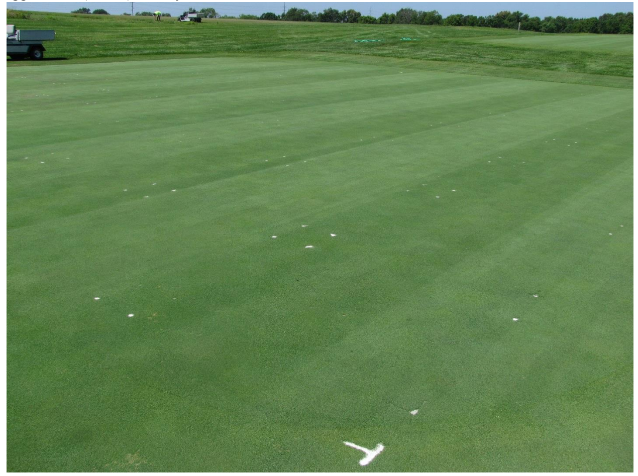
Fig 1. Field plots overall view. Picture were taken at 7 weeks after the initial treatment application (WAIT) on July 11, 2016.