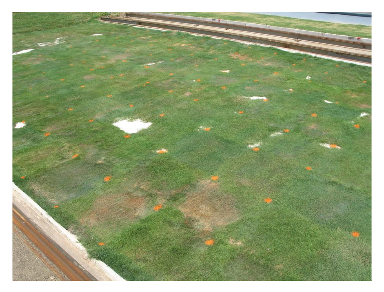
Image taken at the University of Georgia during the 2015 drought stress period demonstrating the range of responses to drought stress with in the population.