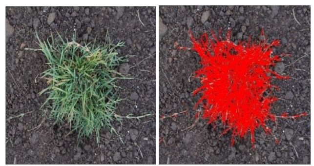
Figure 1: Digital image analysis is used to estimate percent cover by quantifying green pixels.