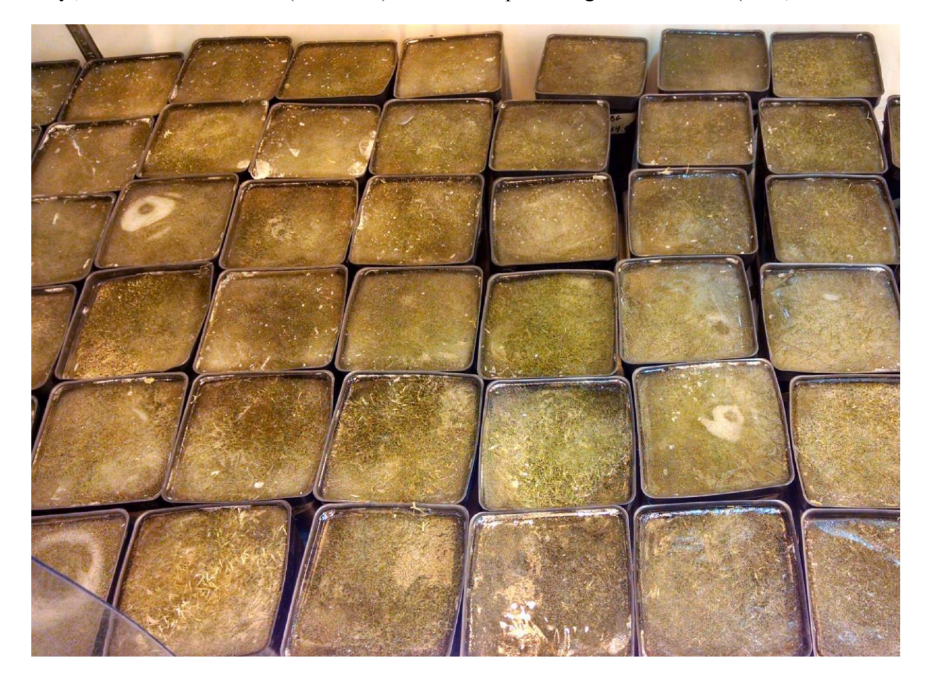
Figure 1 – Annual bluegrass plants treated with Civitas, mefluidide, propiconazole, trinexapac ethyl, or untreated under ice (0.5" thick) in a low temperature growth chamber (-4^{\circ}C)