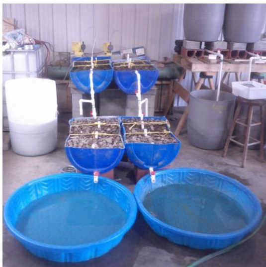
Figure 1: Laboratory S2BR

As a WW feed tank, a 1000 l industrial bulk container tank (IBC) was used. A metering pump was used to transfer the WW from the 1000 l IBC feed tank to cell 1, and from cell 1 to cell 2. The treated WW was discharged from cell 2 into a large pan by opening a 3/4" valve. The S2BR system was installed in a barn at the CERF facility where the temperature was maintained at 70°C.