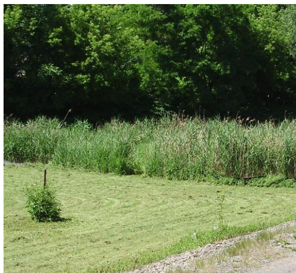
Figure 2: CERF Constructed Wetland