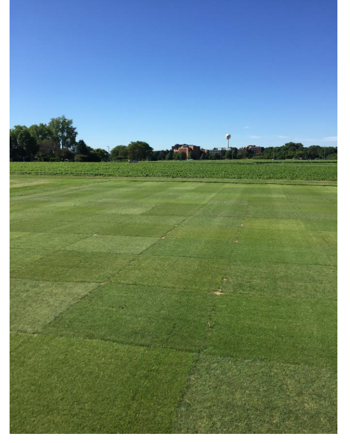
Figure 1. Fine fescue fairway trail in St. Paul, Minnesota that includes entries from the 2013 National Turfgrass Evaluation Program Fine Fescue Test.