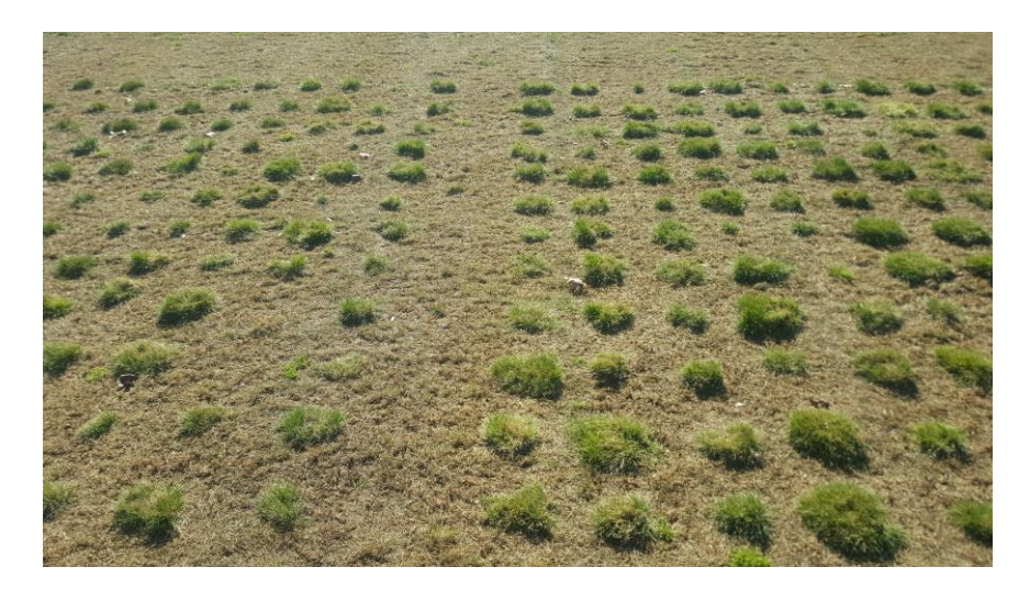
Figure 2. Individual fine fescue plants were planted in both New Jersey and Minnesota. These plants will be subjected to wear in order to identify top performing genotypes.