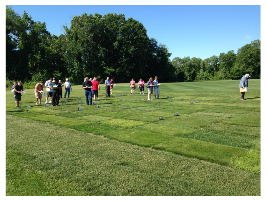
Figure 3. Consumers visited turfgrass plots in both New Jersey and Minnesota to take part in surveys.