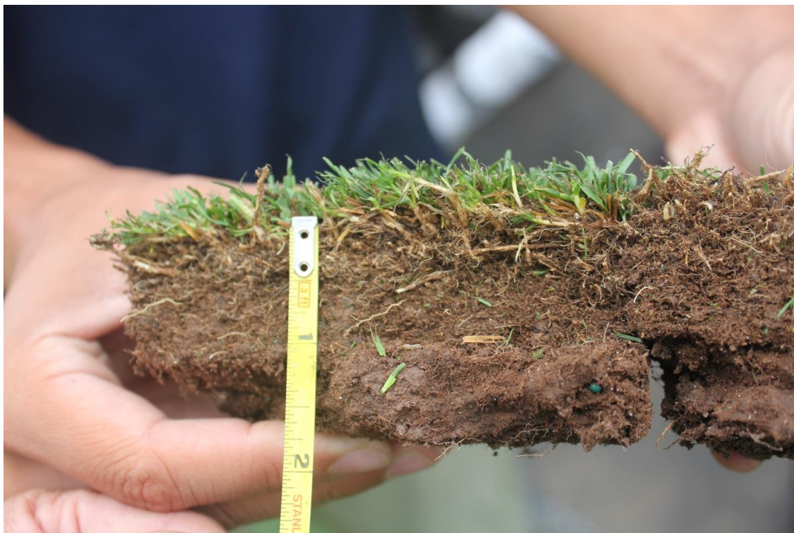
Figure 2. Verticutting the top inch of existing fairways prior to re-seeding increases annual bluegrass contamination.