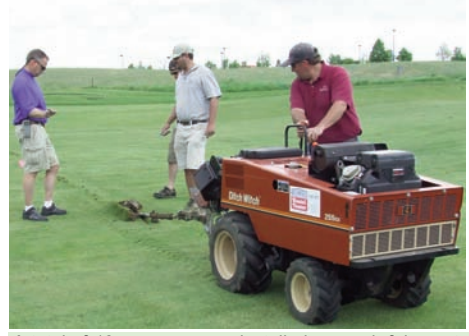
A total of 12 sensors were installed on each fairway to measure temperature, volumetric water content, and electrical conductivity of the soil.

After calibration, data loggers have been programmed to collect data once a day to