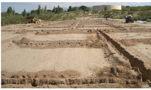
Research was conducted at New Mexico State University's golf course to investigate the effect of physical water conditioners on turfgrass performance and rootzone salinity.

between conditioning treatments were inconclusive. While Fre Flo and Magnawet reduced sodkium adsorptions ratios and soluble salt concentration in saline treated plots at depths of 10 to 30 cm. Neither treatment had a significant impact on electrical conductivity. Zeta Core treated plots recorded lowest or second lowest