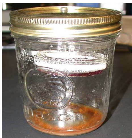
The Illinois Soil Nitrogen Test (ISNT) involves heating soil in a basic solution that converts the amino sugar into ammonia. The ammonia is absorbed by a boric acid indicator solution. The boric acid solution is titrated to measure the ammonium that gives the relative amount of amino sugar in the soil.

The Illinois Soil Nitrogen Test (ISNT) was developed to identify sites in production agriculture that are non-responsive to N fertilizer inputs. The test measures amino sugar N fractions that supply the plant N through mineralization. Briefly, soil is heated in a basic solution that converts the amino sugar into ammonia. The ammonia is absorbed by a boric acid indicator solution. The boric acid solution is titrated to measure the ammonium