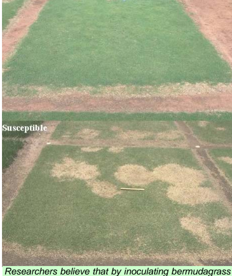
Researchers believe that by inoculating bermudagrass seedlings with Bacilus subtilis, this may make the bermudagrass host resistant to infection by the SDS pathogens.

Over 1200 endophytes from both resistant and susceptible varieties of bermudagrass were isolated. Identification of 223 bermudagrass endophytes through the sequencing of the 16S ribosomal gene showed that bermudagrass endophytes are represented by over 21 genera of bacteria. Only four phyla were represented with over 96% of the endophytes belonging to two phyla: the Actinobacteria and the Proteobacteria. The 223 were screened for antifungal activity which resulted in 35 isolates showing moderate to high levels of activity. The most highly active bermudagrass endophytes were predominately from the genus of Pseudomonas , while the more moderate activity were from