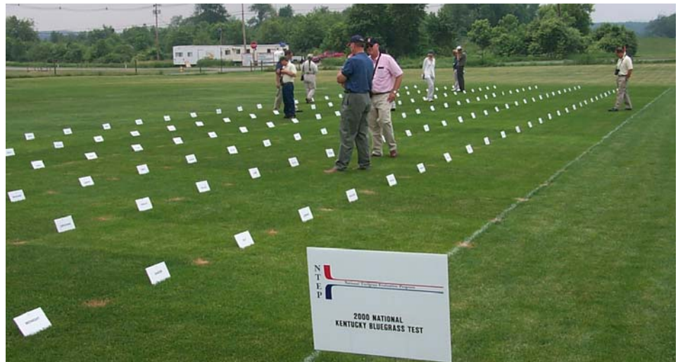
NTEP tests are evaluated at many locations across the nation. It is important to assess which cultivars perform best for particular locations because of regional differences in climate and pest pressure.

Trials completed in 2003 include the 1998 Bentgrass (putting green and fairway/tee) and Fineleaf Fescue Tests. Four years of data collected for each trial has been summarized and is now available on the NTEP web site, www.ntep.org . In addition, 2002 data from Kentucky bluegrass, perennial ryegrass, and tall fescue