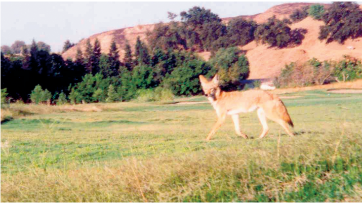
One of the objectives of Audubon International's Coopertive Sanctuarary Program for (66%) or been main-Golf Courses is to work with superintendents to enhance wildlife habitats on existing tained (34%).