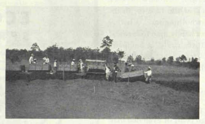
BUILDING NO. 18 GREEN AT THE TOKIO COUNTRY CLUB The Japanese do most of their work by hand labor and at one time Mr. Penglase had 600 men working on the construction of this course. The details as he describes them are extremely interesting.

many mounds and bunkers. This was an exceedingly big task as the dirt, for short hauls, was carried in baskets which held about eight shovels full each. The Japanese balance two of these baskets on a long pole and carry them on their shoulders. For long hauls, they use small dump carts that run on small narrow-gauge tracks. It takes two men to push one of these carts and they usually hitch eight of them in a line each car holding about a yard of material.