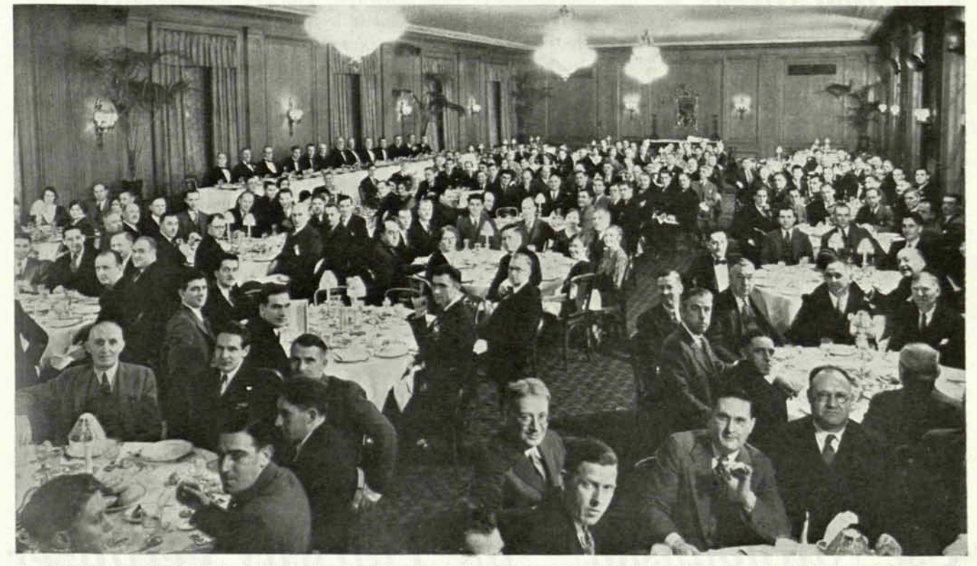
ANNUAL BANQUET OF THE NATIONAL ASSOCIATION OF GREENKEEPERS OF AMERICA, HOTEL PENNSYLVANIA, NEW YORK CITY

At Toledo we were in our infancy, in Louisville we had reached our boyhood, but at New York we had grown to full manhood. The National Association of Greenkeepers of America is now on a journey of success and we trust at Chicago our next stepping stone, that we will repeat the successful gathering held at New York.