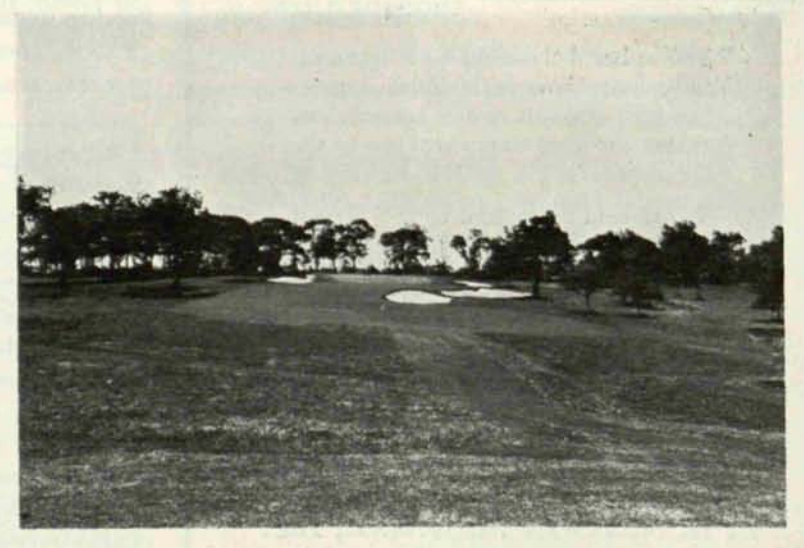
No. 17 at Beverly-200 Yards