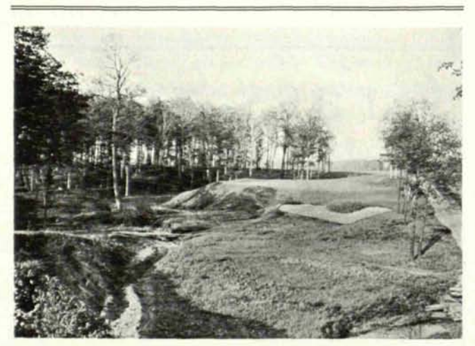
NO. 14 AT THE WESTWOOD COUNTRY CLUB, CLEVELAND

5. I have seen a green that had gone too long