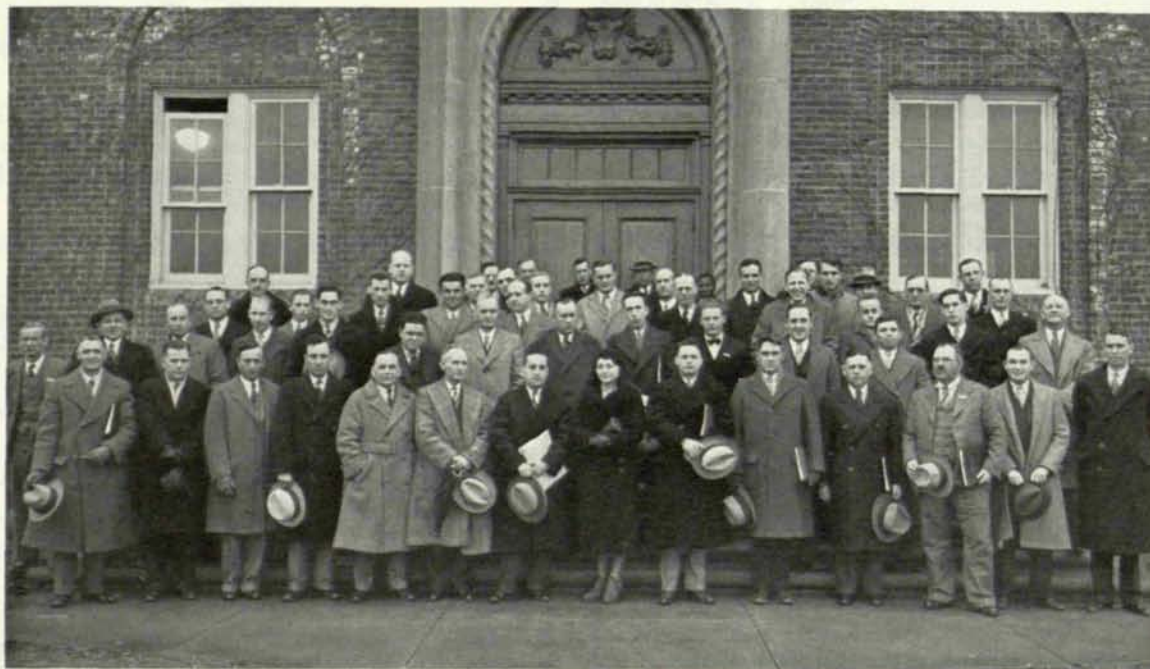
1931 CLASS RUTGERS UNIVERSITY GREENKEEPERS' COURSE