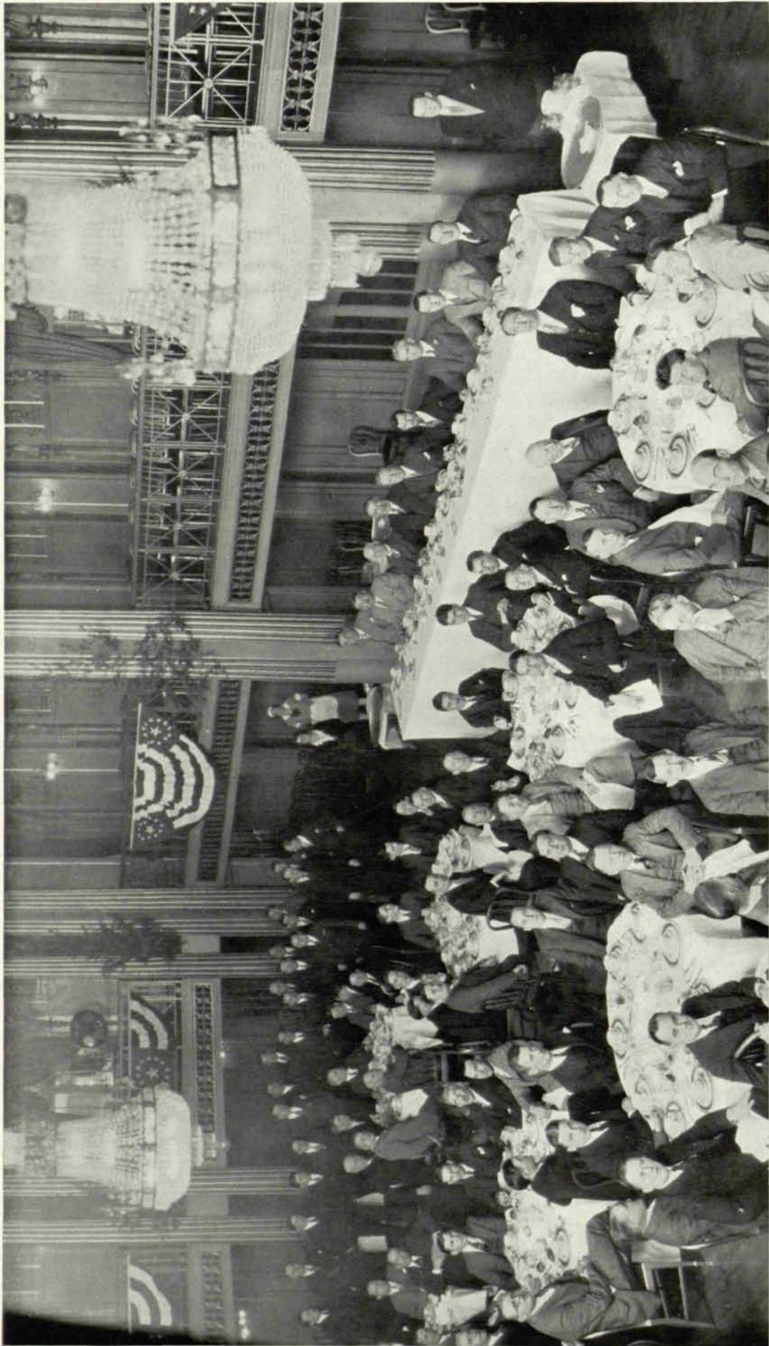
EXHIBITORS' DINNER HELD AT THE DESHLER-WALLICK HOTEL, COLUMBUS, MONDAY EVENING, FEBRUARY 2