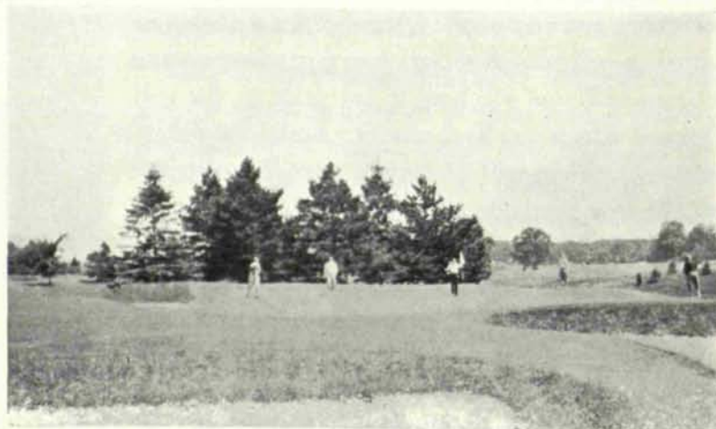
THE 15TH GREEN AT INVERNESS