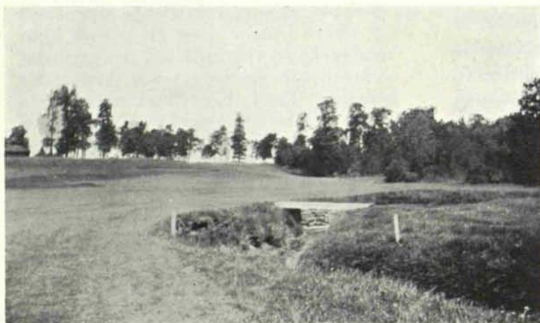
NUMBER 5 HOLE AT INVERNESS

B ACK in 1920, Ted Ray, broad-shouldered English professional, won the United States Open Championship at Inverness. It was a close finish between he and Harry Vardon and Leo Diegel. Times have changed since then and when the golfing talent of the world gather at Inverness July 2 this year there will be many new faces in the picture.