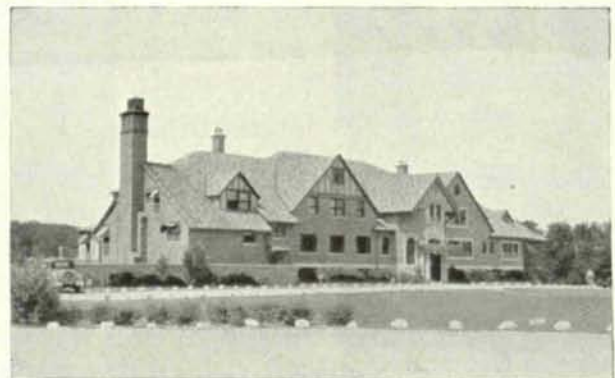
SYLVANIA GOLF CLUB, TOLEDO Where the National Association of Greenkeepers of America was born in September, 1926

Greenkeepers everywhere profit by the practical