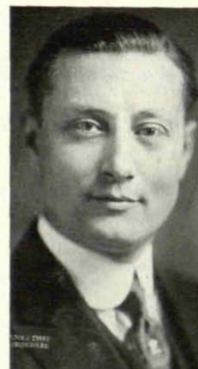
MARTIN L. DAVEY