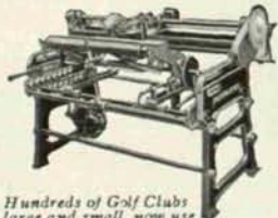
Hundreds of Golf Clubs large and small, now use the Peerless Lawnmower Sharpener.

Special Grinding Wheel Attachment for sharpening grass shears, sickles, scythes, axes, etc. Skate Sharpener attachment sharpens all makes of skates—including hockey. Earns money all the year 'round. Will save its cost the first season. Write for Catalog and list of users.