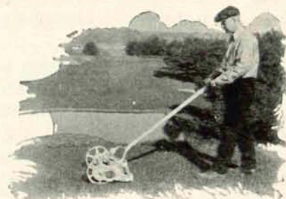
TORO SILVER FLASH MOWER