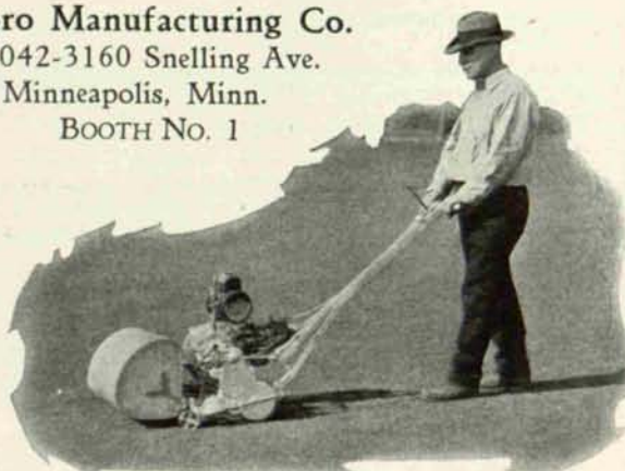
NEW TORO POWER PUTTING MOWER

The main objects of interest, however, will be in their new machines—the power putting green mower, the new Toro Junior tractor, the Silver Flash and the Del Monte Greens rake, all of which