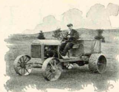
NEW TORO JUNIOR TRACTOR