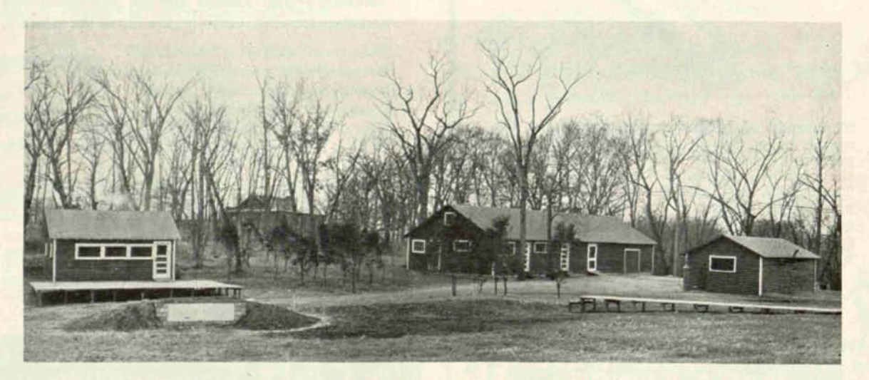
NEW WORK BUILDINGS AT THE MINIKAHDA COUNTRY CLUB

We are located one block from Lake Calhoun, in a neighborhood comprised of homes ranging from $200,000 to $300,000. In fact, this is one of the beauty spots of Minneapolis.