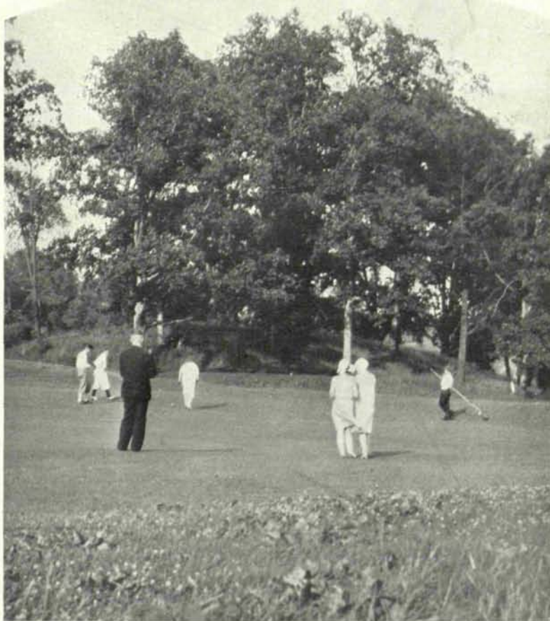
THE 16TH GREEN AT THE BROOKSIDE CLUB, CANTON