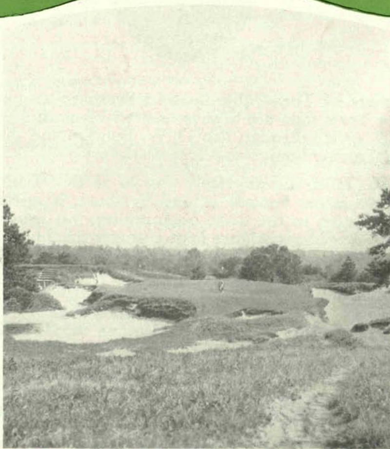
THE SHORT 10TH AT PINE VALLEY This hole is Only about 130 yards long but is one of the sportiest in the world