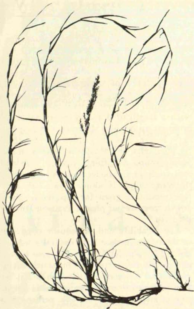
AGROSTIS STOLONIFERA VAR. COMPACTA HARTMAN Creeping bent, known as agrostis stolonifera in U. S. A.

For the latter type of land so-called Rhode Island bent or Browntop is much better suited. This grass, which is related to Creeping bent, grows naturally in rather dry situations. It is a native of Eurasia and Northern Africa, which many years ago was introduced into Canada. At present it is particularly abundant on dry land in the Maritime Provinces, and especially in Prince Edward Island where it grows practically everywhere.