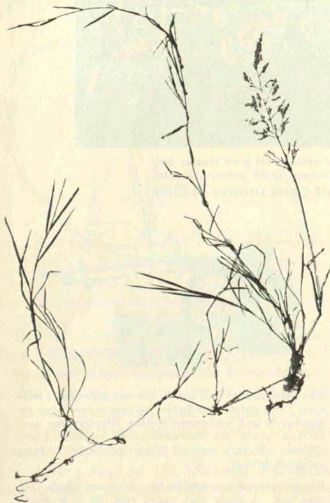
AGROSTIS STOLONIFERA Stoloniferous variety with open panicle

In Canada, the name Redtop is generally applied to the tallest and agriculturally most im-