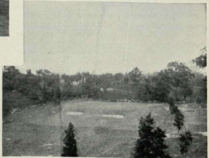
5th Green—a 490 yd. Hole

I would like to thank the members sincerely for their interest in my work, and to assure you that I am with the National Association of Greenkeepers heart and soul.