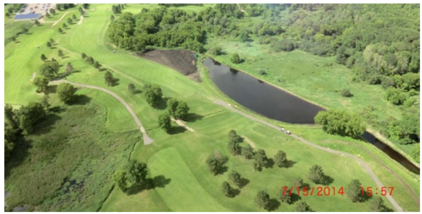
The newly created containment pond on Oneka Ridge Golf Course captures phosphorous laden water from urban and agricultural runoff.

Do you have a local source of reusable water for use on your course?