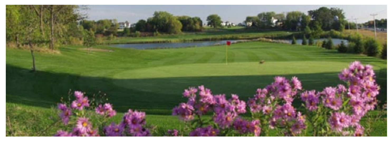
Enhanced water features and Environmental Stewardship reign at Eagle Valley Golf Club

After all calculations and analyses are complete, the Eagle Valley Golf Course expects to utilize 22.5 million gallons (69 ac-ft.) of stormwater per year. These expected volumes will likely vary by year depending on precipitation amounts.