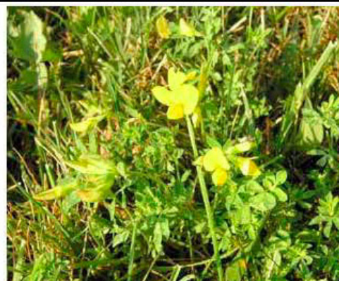
Birdsfoot trefoil Lotus corniculatus Fall