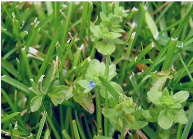
Corn Speedwell - Veronica arvensis