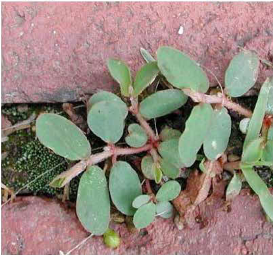
Spurge - Euphorbia supina (Milky sap distinguishes from knotweed)