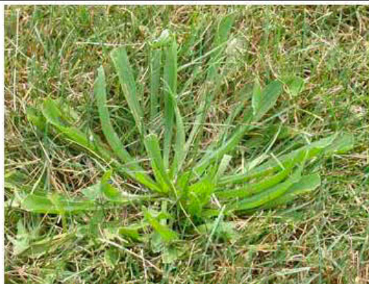
Buckhorn Plantain Plantago lanceolata Fall