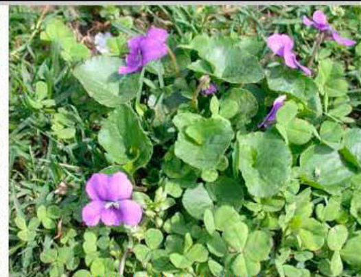
Wild Violet Viola papilionacea Spring or fall