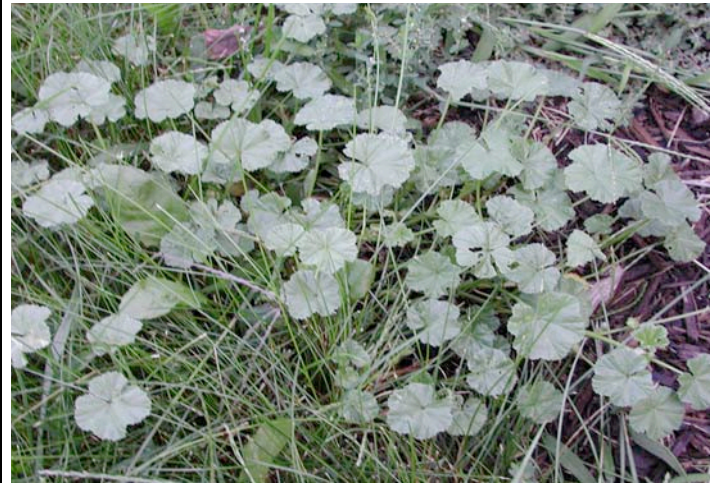
Mallow - Malva rotundifolia (Has a central taproot and does not root at the nodes)