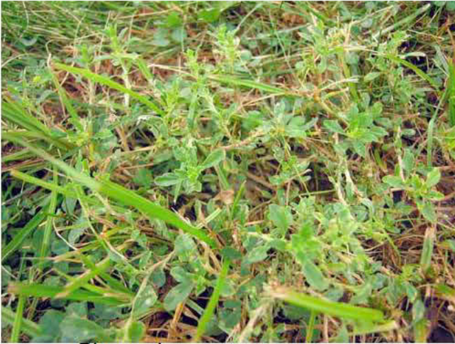
Pigweed - Amaranthus blitoides (May have reddish stem and taproot)