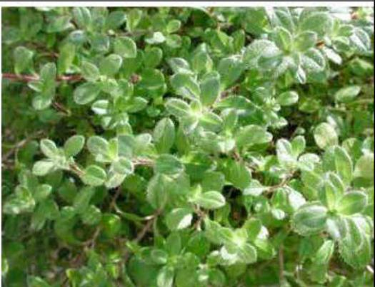
Mouse ear Chickweed Cerastium vulgatum Fall