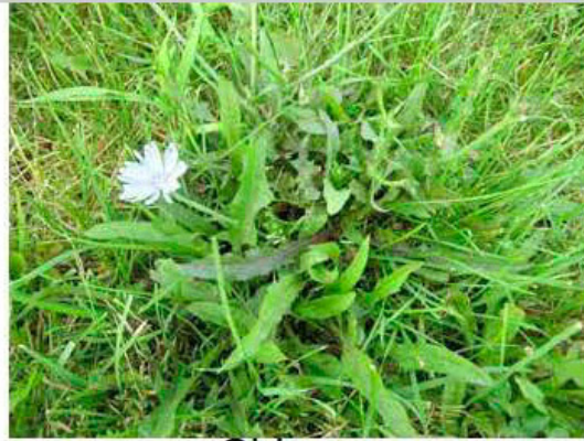
Chicory Chicorium intybus Spring