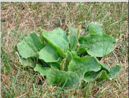
Blackseed Plantain Plantago rugelii Fall