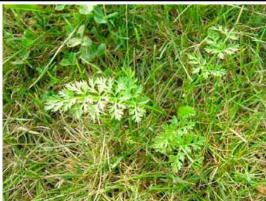
Wild Carrot (B) Daucus carota Spring or Fall