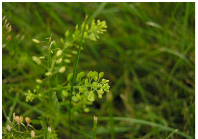
Virginia Pepperweed -