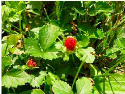
Indian Mock-Strawberry Duchesnea indica