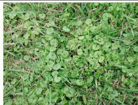
Ground Ivy Glechoma hederacea Spring or fall