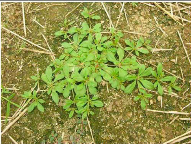
Carpetweed - Mollugo verticillata