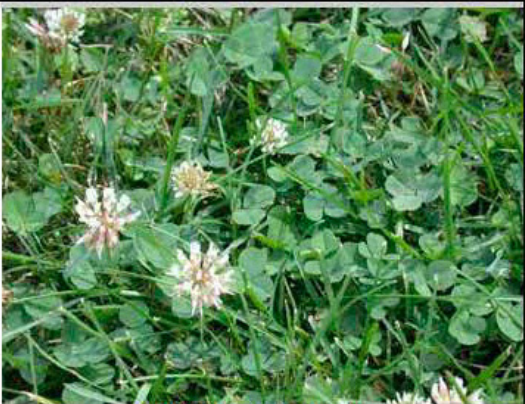
White Clover Trifolium repens Fall

Figure includes recommended timing of herbicide application for best control.