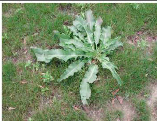
Curly Dock Rumex crispus Fall