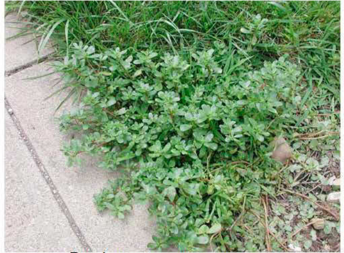
Purslane - Portulaca oleracea (Fleshy leaves)