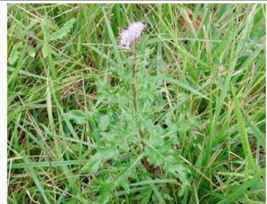
Canada Thistle Cirsium arvense Fall