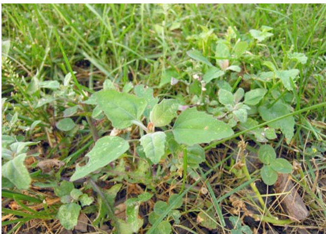
Lambsquarters - Chenopodium album