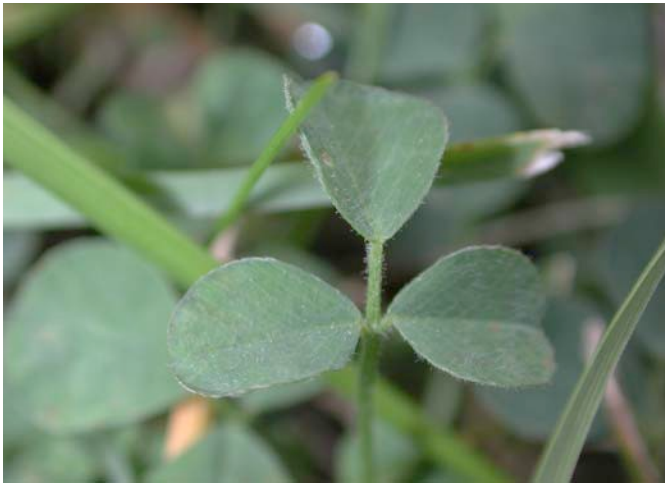
Black medic - Medicago lupulina (Stem on end leaf distinguishes from white clover)