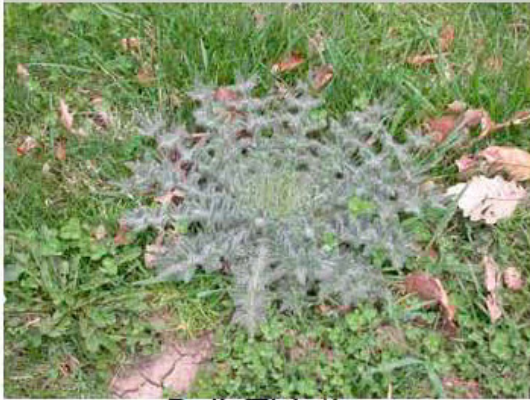
Bull Thistle Cirsium vulgare Fall

Figure includes recommended timing of herbicide application for best control.