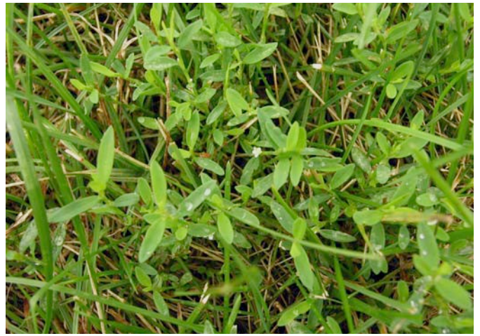
Knotweed - Polygonum aviculare (Sometimes confused with crabgrass when first emerging)