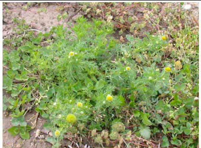
Pineappleweed - Matricaria matricarioides