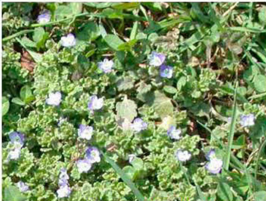
Creeping Speedwell Veronica filiformis Fall