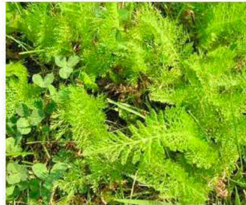
Yarrow Achillea millefolium Late spring to midsummer