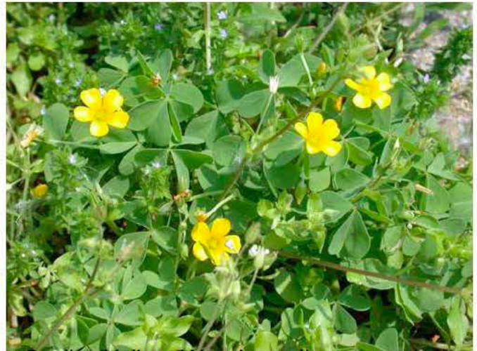
Oxalis (Yellow Woodsorrel) - Oxalis stricta (Heart-shaped leaves)