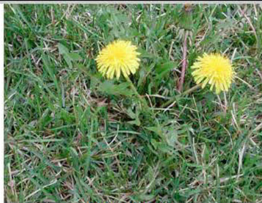
Dandelion Taraxacum officinale Late spring or fall