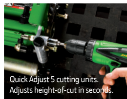
Quick Adjust 5 cutting units. Adjusts height-of-cut in seconds.