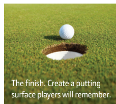
The finish. Create a putting surface players will remember.