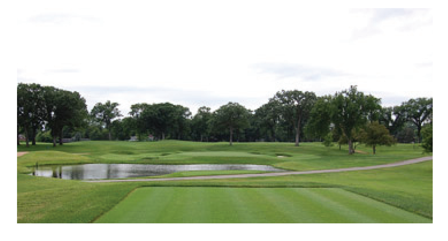
Edina Country Club