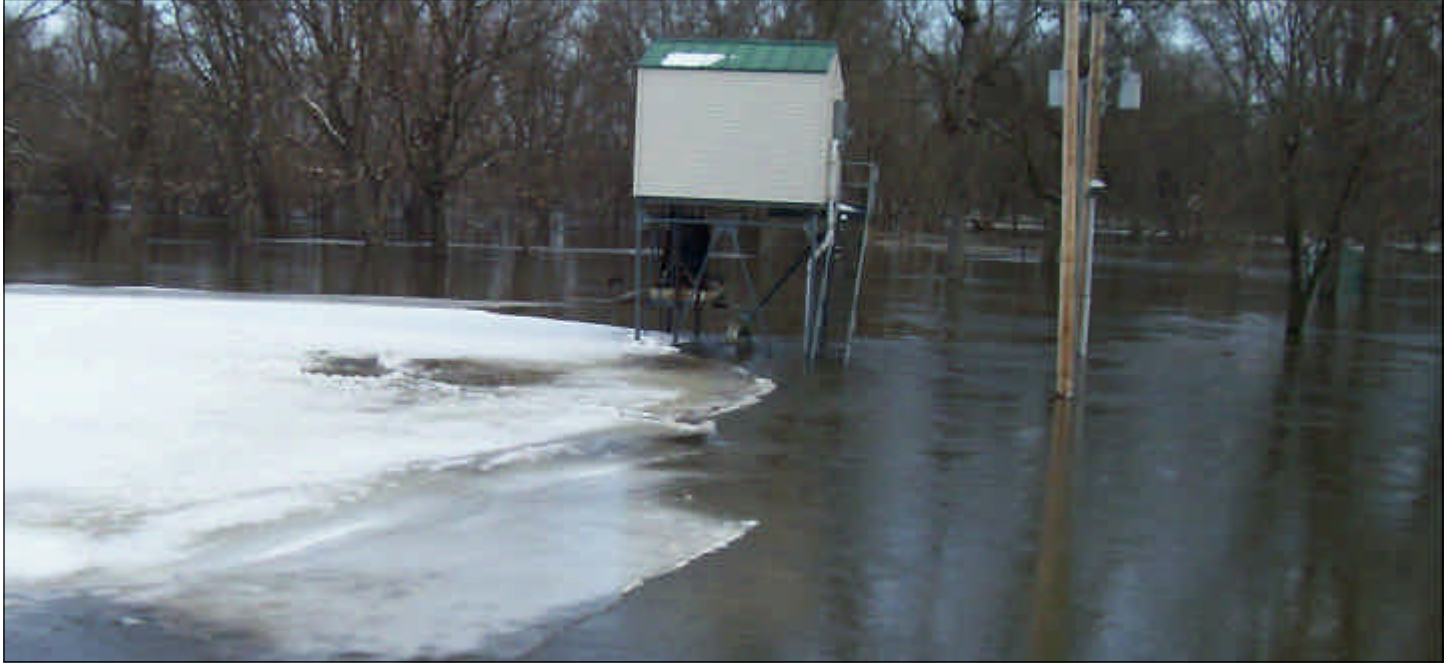
Here is a good sign that it is Spring at The Crossings at Montevideo - the pumphouse has plenty of water! - Jeremiah Ergon, The Crossings at Montevideo .

MGCSA members were asked: What is your first sign that Spring has arrived? The Good, the Bad or the Ugly!