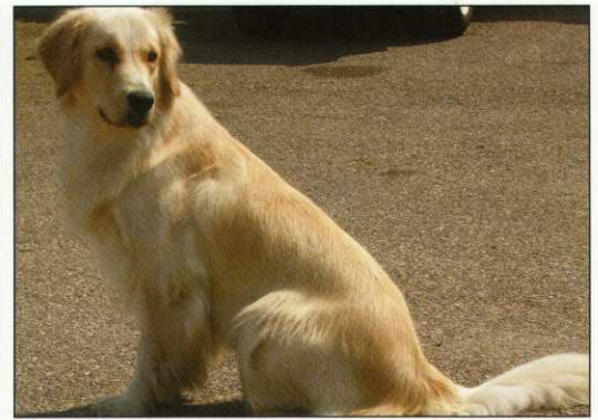
Lena, a 4-year-old Golden Retriever, enjoys every ride she can get and will go with anyone on the crew.