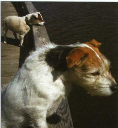
Five-year-old Mona, a 13-year-old Champ (background) are Jack Russell Terriers that love pheasant hunting and hate geese!