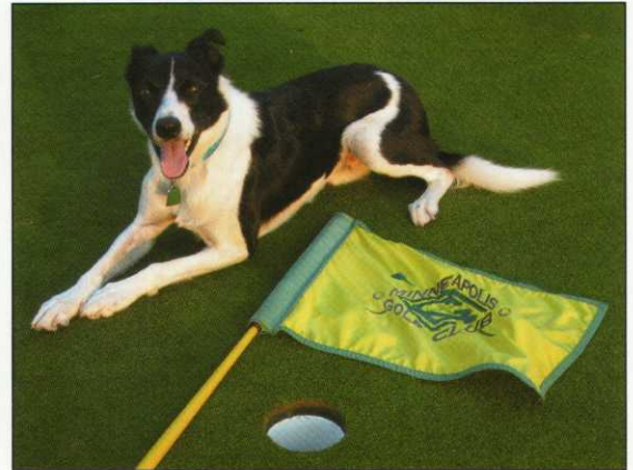
Zip , the world's fastest goose dog, as well as the most popular crew member and best investment ever made according to most members. - Dale Caldwell, CGCS, Minneapolis GC