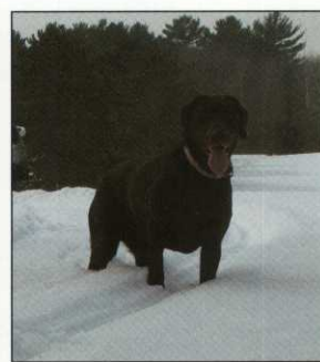
Tempest , 3-year-old chocolate lab, loves winter because there are no play-time restrictions. Her favorite golf course activity is retrieving harvested waterfowl during the hunting season. - Eric Ritter, Spooner GC