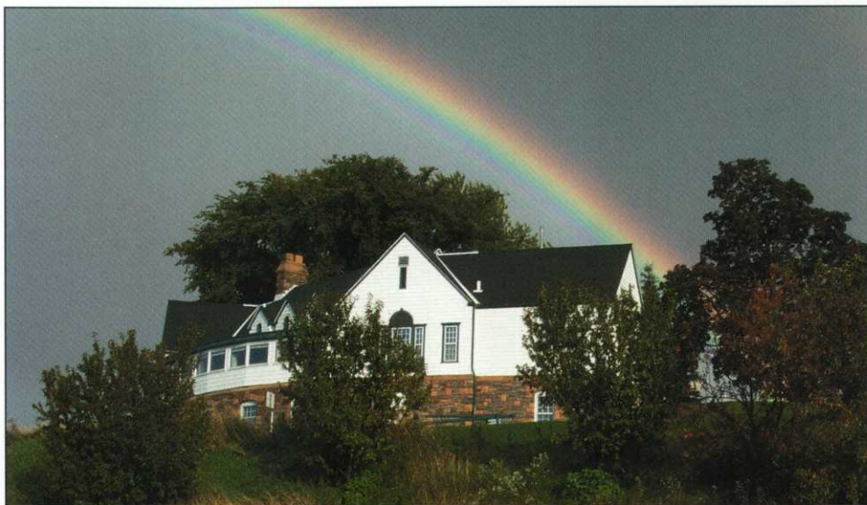
Keller Golf Course in St. Paul

staff to replace 60%-80% of daily ET values. The operation also relies on wireless remote moisture sensors to maximize water use efficiency and we hope to expand upon their use in the near future.