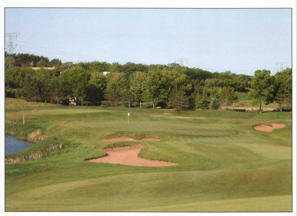
No. 10 at StoneRidge Golf Club

around the soils that the golf course was built upon. The property used to be a sand and gravel pit, so needless to say drainage is not one of our major challenges. However, with that being said, keeping the soil moisture at acceptable levels provides enough work in itself. Needless to say, Poa annua has a very difficult time finding its ideal growing environment here at StoneRidge. Though we do have continuous cartpaths, I have really never had to restrict carts in my three years here. We can take a two-inch rain at 4:00 am and be mowing fairways at 5:30 am.