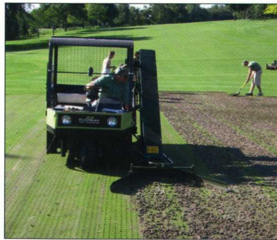
Aeration of No. 18 green

Hazardous Waste Recycling: All hazardous waste such as waste oil, oil filters, batteries, fluorescent bulbs, and paint by-products is safely col-