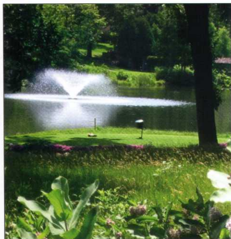
Pond, milkweed and No. 12 tee