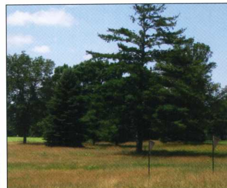
No-mow, pines and bluebird houses