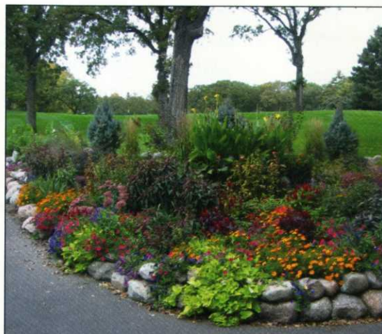
Flowers at Minnesota Valley

Cultural Practices: An excellent Integrated Pest Management program is practiced that guides decision-making and cultural maintenance practices such as water management, pesticide use, fertilizer use, plant selection and cultivation procedures.