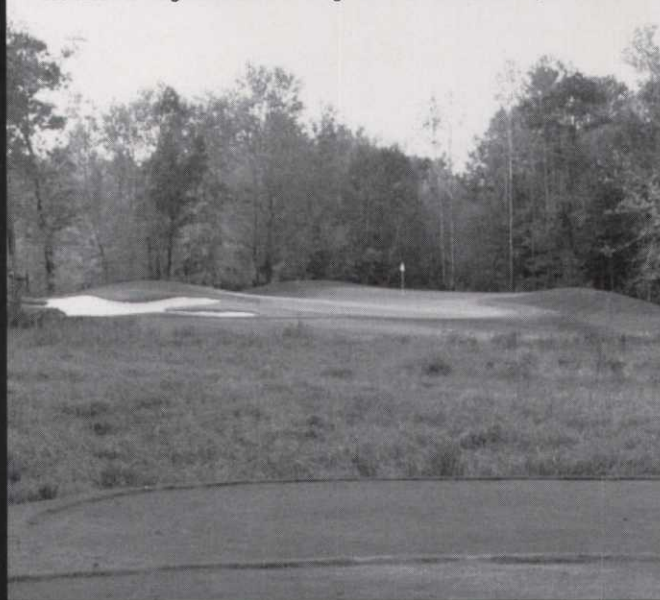
163 Yard Par 3 eighth hole at the Refuge Golf Club in Oak Grove, Minnesota.