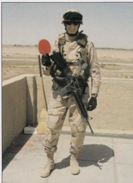
Table tennis anyone?

Hello all. I am still here, again. Sorry that I missed a week. I was on vacation and just wanted to relax and get away