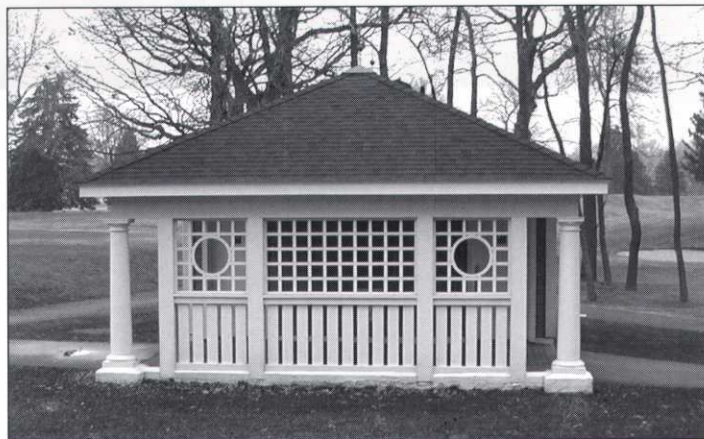
Golfers appreciate the quality restrooms at North Oaks GC.

Believe me when I say that the on-course rest rooms at North Oaks Golf Club are the Taj Mahal of biffys. They make a first class