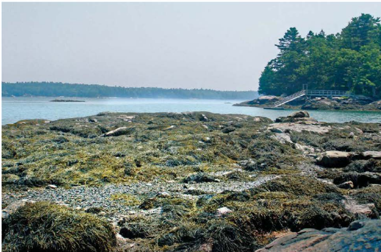
A. nodosum on the coast of Maine.