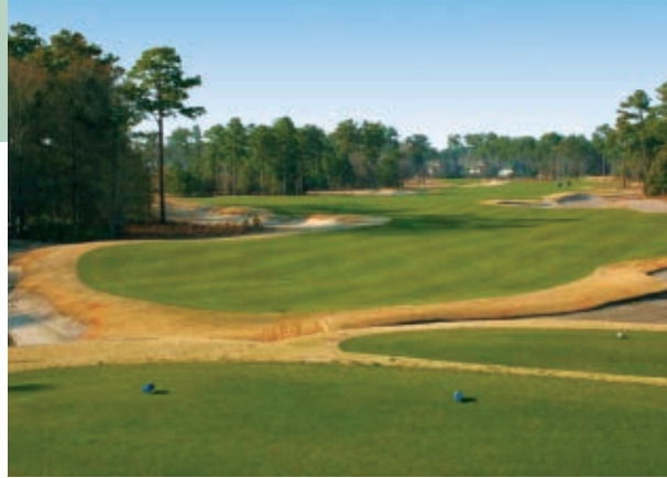
The tees, fairways and greens of this Southern golf course are overseeded with a cool-season grass. Its warm-season bermudagrass borders are dormant and brown.