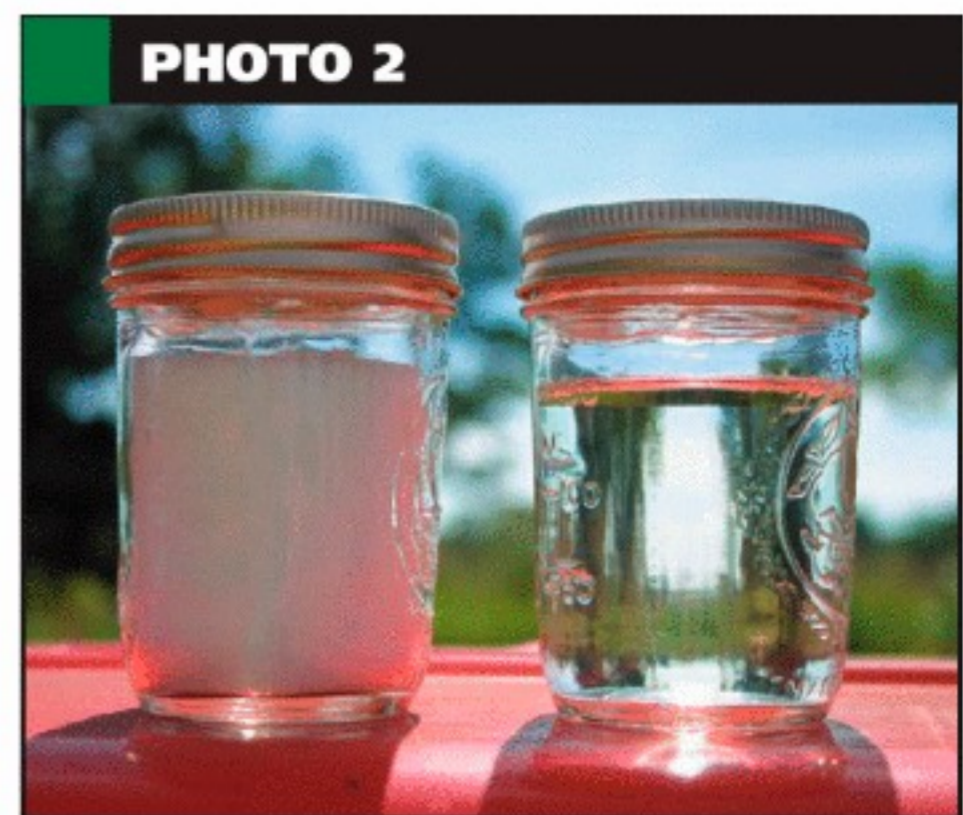
PHOTO 2 Lye and methanol are the ingredients that help allow transesterification.

Several equipment manufacturers only recently began to accept limited use of biodiesel blends in their equipment, and they have severely limited what can be used and not void their warranty. The Toro Co. recently clarified its position on biofuels saying that while five percentage (B5) blends are preferred, biodiesel concentration up