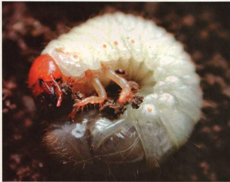
Fully grown masked chafer larva. Note the C-shaped body and the presence of three pairs of legs.

The Japanese beetle has spread as far south as Georgia and west to the Mississippi. Other exotic species have been introduced into peninsular Florida, but their biology and capacity for causing problems on turfgrass is not well understood. Several native species including the green June beetle ( Cotinus nitida ), black turfgrass ataenius ( Ataenius spretulus ), northern masked chafer ( Cyclocephala borealis ), southern masked chafer ( Cyclocephala lurida ), southwestern masked chafer ( Cyclocephala pasadenae ) and a variety of June beetle species ( Phyllophaga spp.)