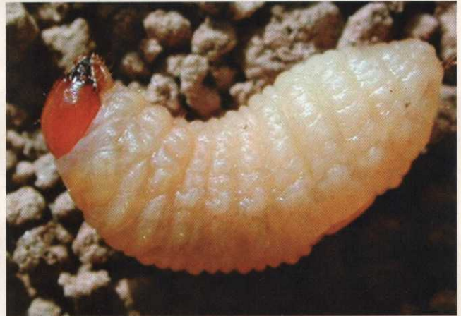
Fully grown bluegrass billbug larva. Notice that the larva is legless.

In general, mating and dispersal flights take place during spring and usually occur around dusk. Short-winged mole crickets do not fly but disperse by tunneling or crawling instead. Egg laying occurs shortly after mating, and eggs may take up to 30 days to hatch. The larvae then spend the summer feeding on plant roots (short-winged and tawny) or