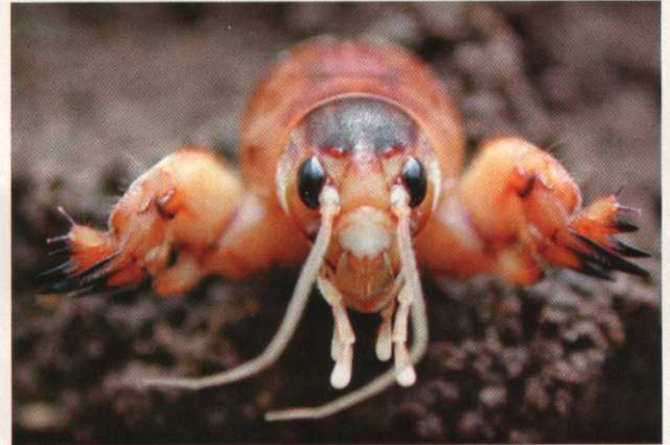
Adult tawny mole cricket with front legs equipped for digging.

Although there are about seven species of mole crickets found in turfgrass in the United States, only four of these species are considered pests — the northern mole cricket ( Neocurtilla hexadactyla ), the southern mole cricket ( Scapteriscus borellii ), the tawny mole cricket ( Scapteriscus vicinus ) and the short-winged mole cricket ( Scapteriscus abbreviatus ).